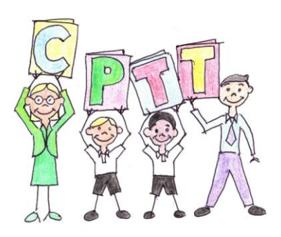
Children, Parents, Teachers Together