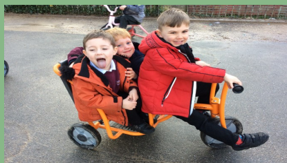
Help Us Grow Green

Children have been enjoying the new trikes kindly funded by the Hele's Trust as part of our H.U.G.G. Project!