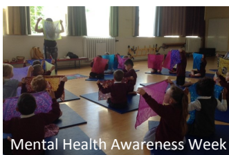
Mental Health Awareness Week

Here at Ladysmith, we have had a week thinking about our wellbeing. We have enjoyed calm yoga classes, as well as thinking about the importance of getting outside and being active. There have also been mindful art classes taking place too!